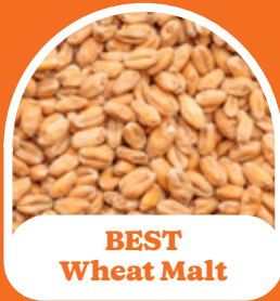
BEST Wheat Malt

Colour °EBC: 3.5-6.0 Moisture (%): 5.5 max. Protein: 14.0 max. Extract (%): 82.0 min.