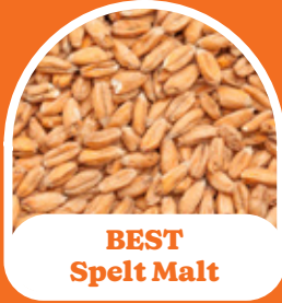
BEST Spelt Malt

Colour °EBC: 3.5-6.0 Moisture (%): 5.5 max. Protein: 14.0 max. Extract (%): 82.0 min.