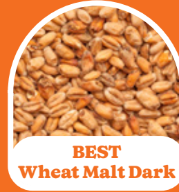
BEST Wheat Malt Dark

Colour °EBC: 3.5-6.0 Moisture (%): 5.5 max. Protein: 13-15 Extract (%): 82.0 min.