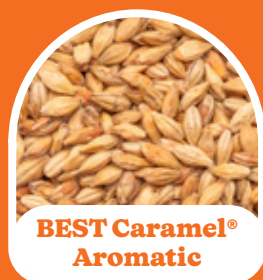
BEST Caramel® Aromatic

Colour °EBC: 3.0-7.0 Moisture (%): 4.5 max. Protein: 12.0 max Extract (%): 75.0 min.