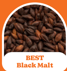
BEST Black Malt

Colour °EBC: 800-1000 Moisture (%): 4.5 max. Protein: N/A Extract (%): 75.0 min.