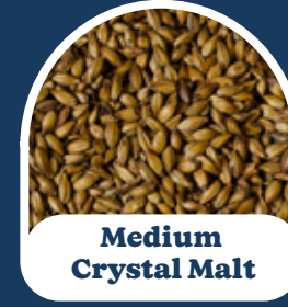
Medium Crystal Malt

Colour °EBC: 80-110 Moisture (%): 4.5 max. Protein: N/A. Extract (%): 77.0 min.