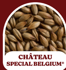
CHÂTEAU SPECIAL BELGIUM®

Colour °EBC: 15.9-18.9 Moisture (%): 4.5 max. Protein: N/A Extract (%): 78.0 min.