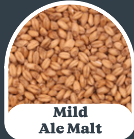
Mild Ale Malt

Colour °EBC: 3.3-4.5 Moisture (%): 4.5 max. Protein: N/A Extract (%): 80.0 min.