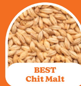
BEST Chit Malt

Colour °EBC: 3.0-8.0 Moisture (%): 8.0 max. Protein: 13.0 max. Extract (%): 76.0 min.