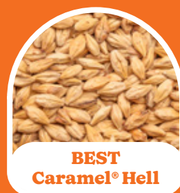
BEST Caramel® Hell

Colour °EBC: 131-200 Moisture (%): 4.5 max. Protein: 12.0 max. Extract (%): 75.0 min.