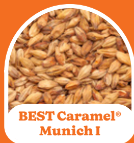
BEST Caramel® Munich I

Colour °EBC: 41-60 Moisture (%): 4.5 max. Protein: 12.0 max Extract (%): 75.0 min.