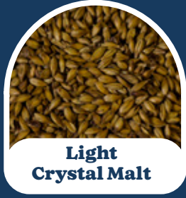
Light Crystal Malt

Colour °EBC: 55-75 Moisture (%): 6.0 max. Protein: N/A Extract (%): 77.0 min..