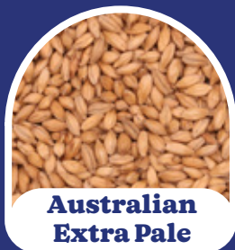
Australian Extra Pale

Colour °EBC: 14-20 Moisture (%): N/A Protein: N/A Extract (%): N/A