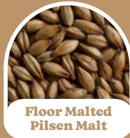
Floor Malted Pilsen Malt

Colour °EBC: 3.0-4.0 Moisture (%): 5 max. Protein: 11.8 max. Extract (%): 80.5 min.