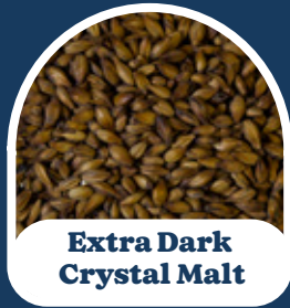
Extra Dark Crystal Malt

Colour °EBC: 140-160 Moisture (%): 4.5 max. Protein: N/A Extract (%): 77.0 min.