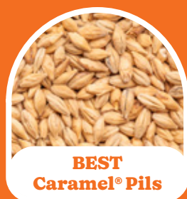
BEST Caramel® Pils

Colour °EBC: 3.0-7.0 Moisture (%): 4.5 max. Protein: 12.0 max Extract (%): 75.0 min.