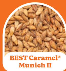
BEST Caramel® Munich II

Colour °EBC: 61-80 Moisture (%): 4.5 max. Protein: 12.0 max. Extract (%): 75.0 min.