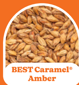
BEST Caramel® Amber

Colour °EBC: 20-40 Moisture (%): 4.5 max. Protein: 12.0 max. Extract (%): 75.0 min.