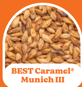
BEST Caramel® Munich III

Colour °EBC: 81-100 Moisture (%): 4.5 max. Protein: 12.0 max. Extract (%): 75.0 min.