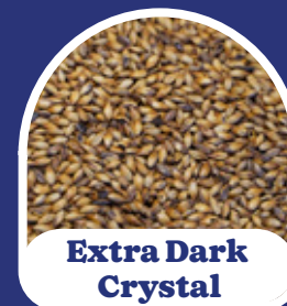
Extra Dark Crystal

Colour °EBC: 250-300 Moisture (%): 4.5 Max Protein: N/A Extract (%): N/A