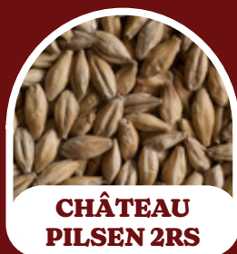
CHÂTEAU PILSEN 2RS

Colour °EBC: 2.1 - 3.2 Moisture (%): 4.5 max. Protein: 11.5 max. Extract (%): 81.5 min.